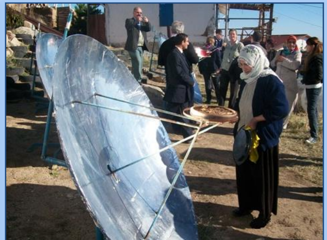
A visit To Eco Village (Solar Cooker-Kerkenes)