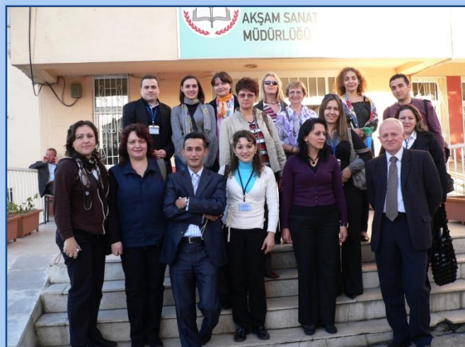
Visiting Yozgat Adult Education Centre