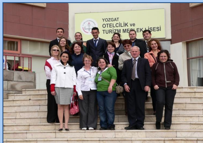
Meeting Place & Hotel