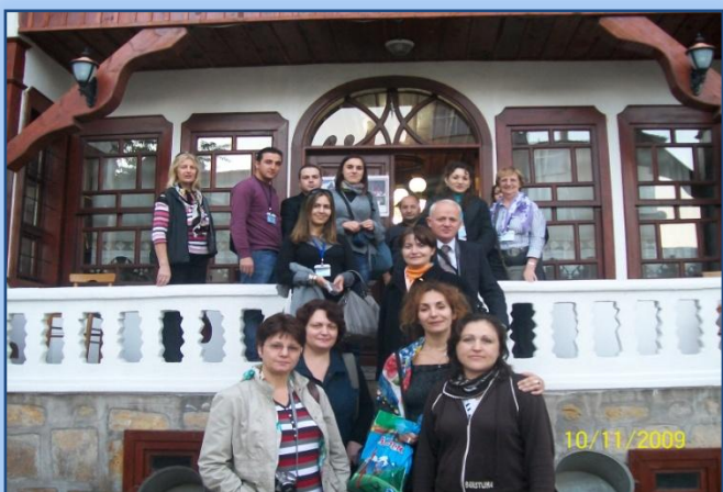
Hayri İnal Mansion