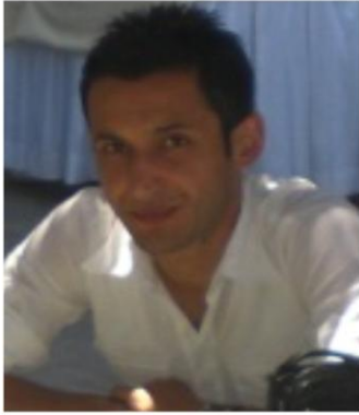
ENVER TUFANER TURKEY