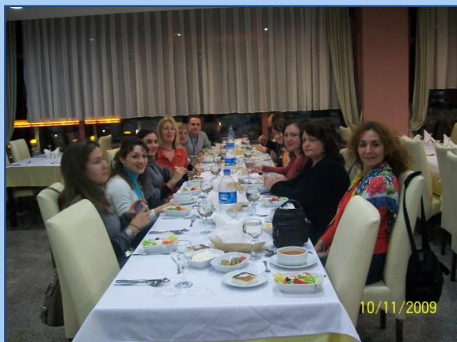
Traditional Turkish Kitchen & Dishes