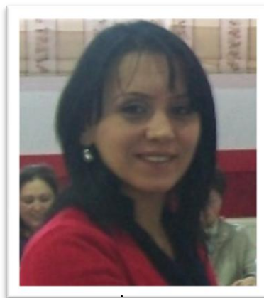
BURÇİN ERGEN TURKEY