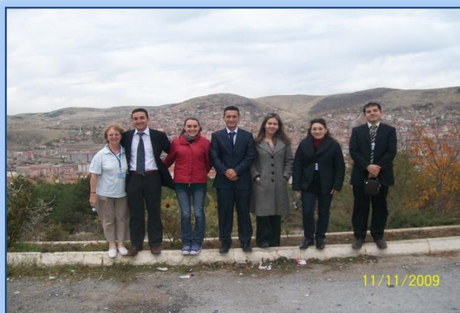
City Tour (ÇAMLIK)