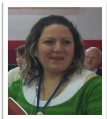
KADER AKSU TURKEY