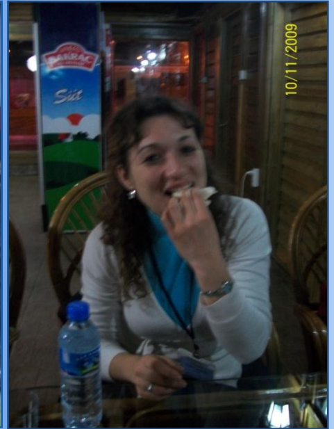
Traditional Turkish Food (Çiğ Köfte)