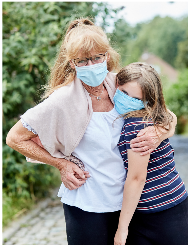
The European Commission is outlining a vaccination campaign against the coronavirus

Your role in such a campaign can be to identify local ambassadors that help us achieve the EU communication goals and coordinate with other relevant EU networks (which, as you know, is something we would like you to do anyway). We will come back to you in the coming weeks with more details about this upcoming communication campaign - so stay tuned!