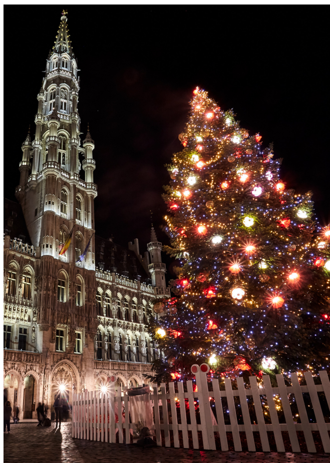
A night view of the Christmas tree of the Grand-Place of Brussels.

European Parliament plenary session Brussels