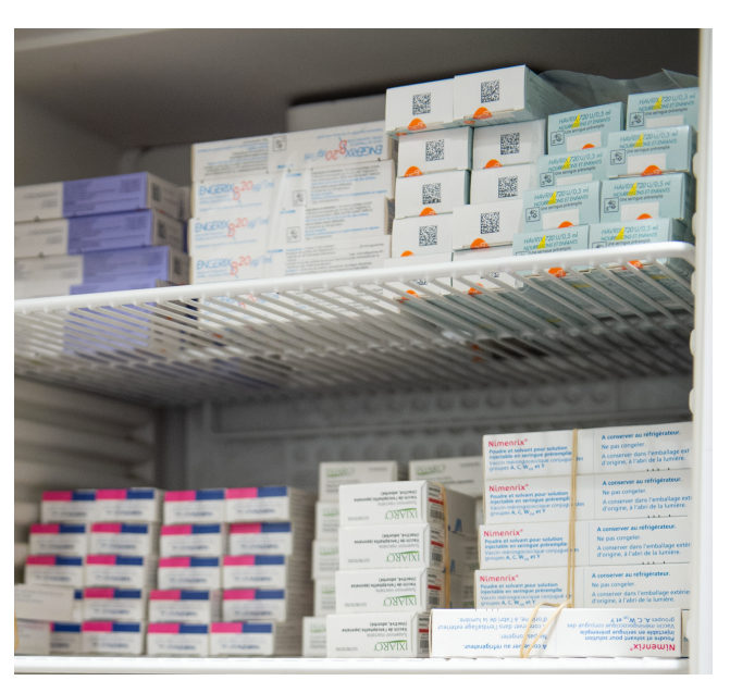
Vaccination equipment at Air France's international vaccination centre, European Union, 2020, EC - Audiovisual Service, P-047912/00-28

<u>03-05/02 Plenary meeting of the European</u> <u>Committee of the Regions</u>, online