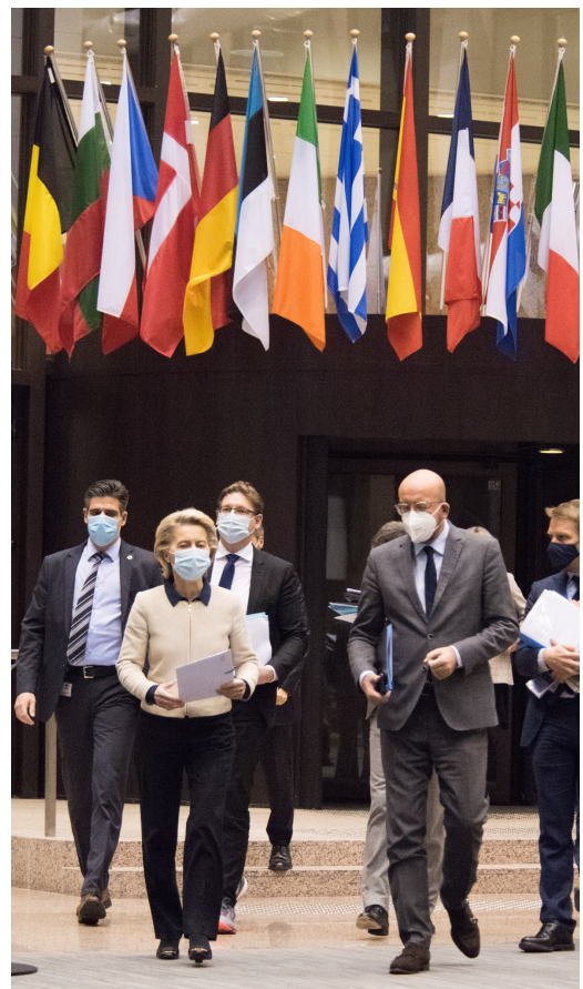
Commission president von der Leyen and European Council president Michel at the EU leaders' videoconference, on 19/11/2020

Use it under the angle that fits your interlocutors best!