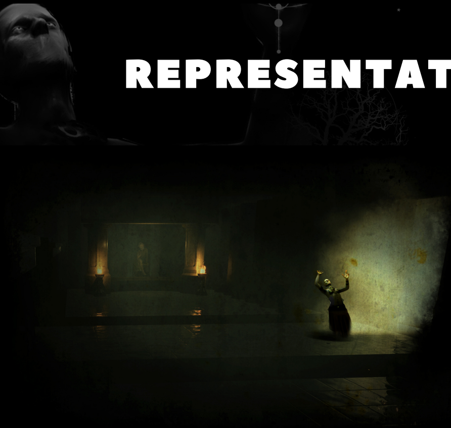
1.TIMES IMMEMORIAL - ELEUSIS TEMPLE -