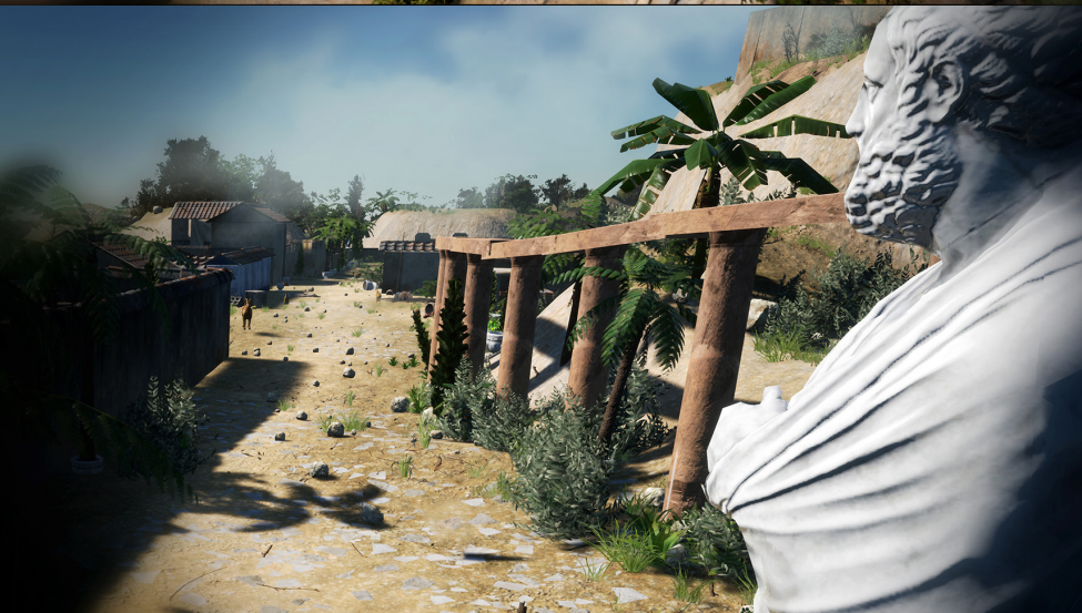
3.ANCIENT GREECE - ATHENS -