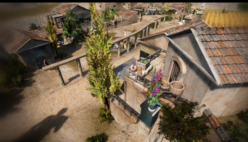
2.ANCIENT GREECE - VILLAGE OF ELEUSIS -